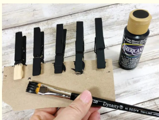
Paint clothes pins black