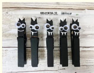
Add on your googly eyes