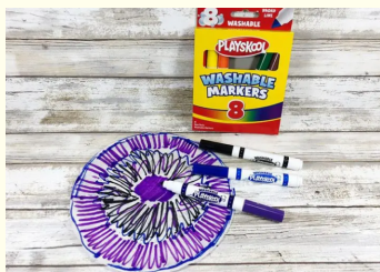
Color your filters using washable marker & spritz with water