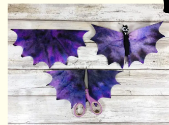
Fold in half, cut a scalloped edge and cut a slit Add your clothes pin body